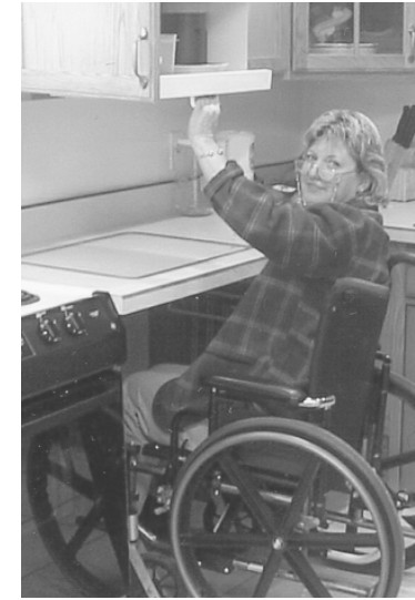
Wheelchair space under counter and stove with controls in front