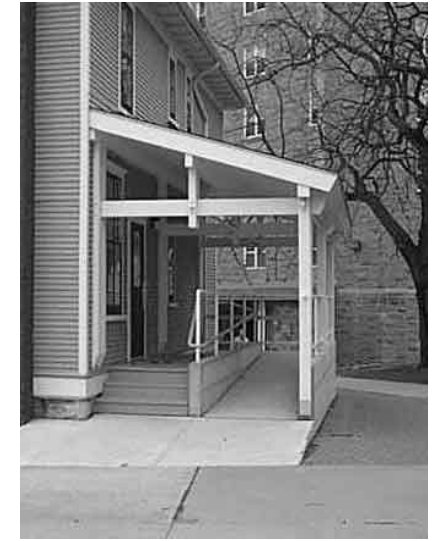
Stepped entry with integrated wheelchair ramp

Turnover costs average $497.00 per unit or $0.54 per square foot.