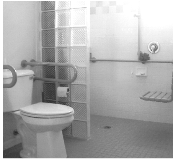
Roll-in shower and toilet with grab bars